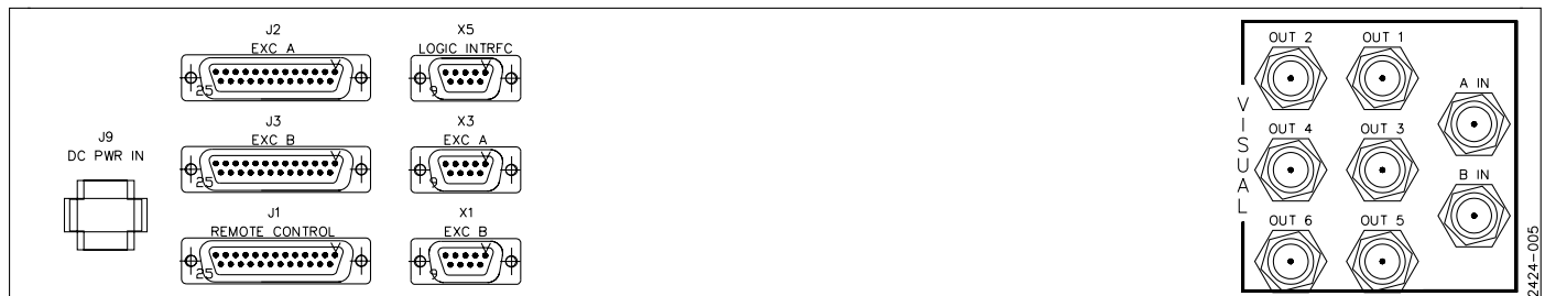
Figure 2-1 Rear View of Exciter Switcher

Configuration of the exciter switcher is normally done in the factory when the switcher is assembled into and tested with the transmitter. If a switcher is installed at a later date, consult Drawing 839 8203 001, Sheet 5 for a table of jumper settings for all versions of the switcher.